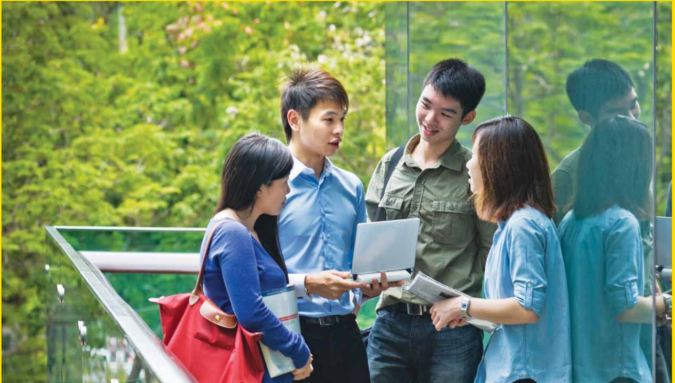
CHART YOUR OWN EDUCATION