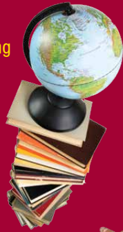
CHART YOUR OWN EDUCATION

# Source: Brigham Young University Accounting Research Rankings as at February 2015