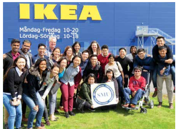
SMU Scholars visiting IKEA on a Scandinavian study mission to enhance their understanding of sustainability and its important role in society and business development.

FIND YOUR DREAM SCHOLARSHIP AT https://admissions.smu.edu.sg/ scholarships