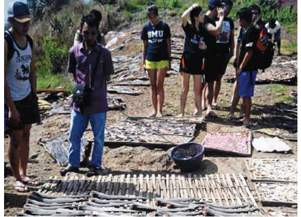
Project Lombok. A group of SMU Scholars learned about how shark fishermen in Lombok are educated on the unsustainable nature of their current trade. They also assisted these fishermen to embrace a more sustainable trade like taking tourists on their boats for sightseeing.